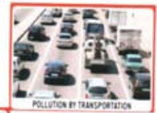
POLLUTION BY TRANSPORTATION