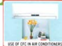
USE OF CFC IN AIR CONDITIONERS