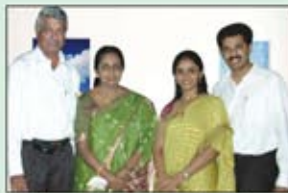
Venturing together for the cause of education

At this very important moment we are glad to share with you all that we are grandly marching towards our "Vision of building knowledge centers of excellence there by providing a true learning experience in a world class environment".