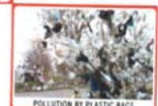
POLLUTION BY PLASTIC BAGS