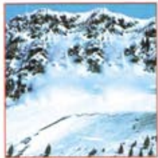
АВАЛАНЧЕ हिम स्खलन